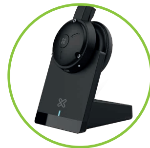
Magnetic charging base